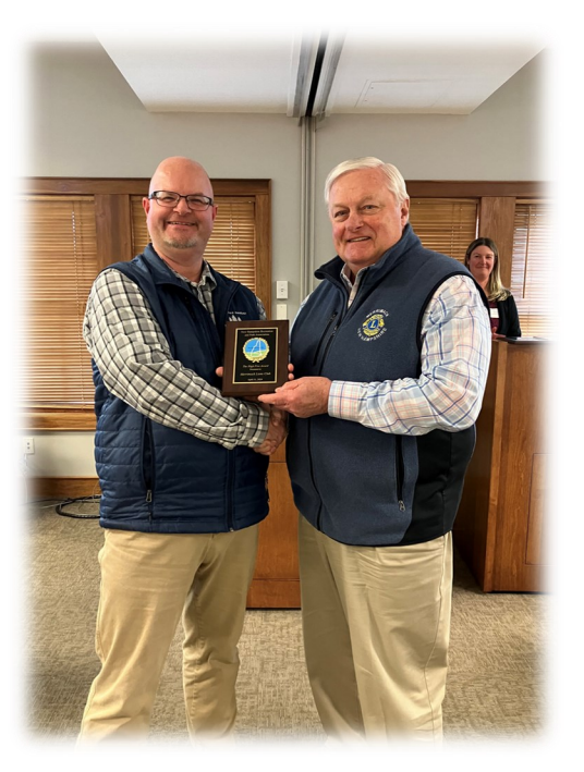
Merrimack Lions Club Winner High Five Award