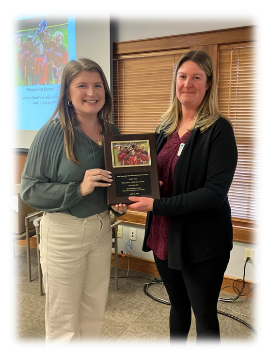
Newmarket Recreation Fab 4 FOTO Award