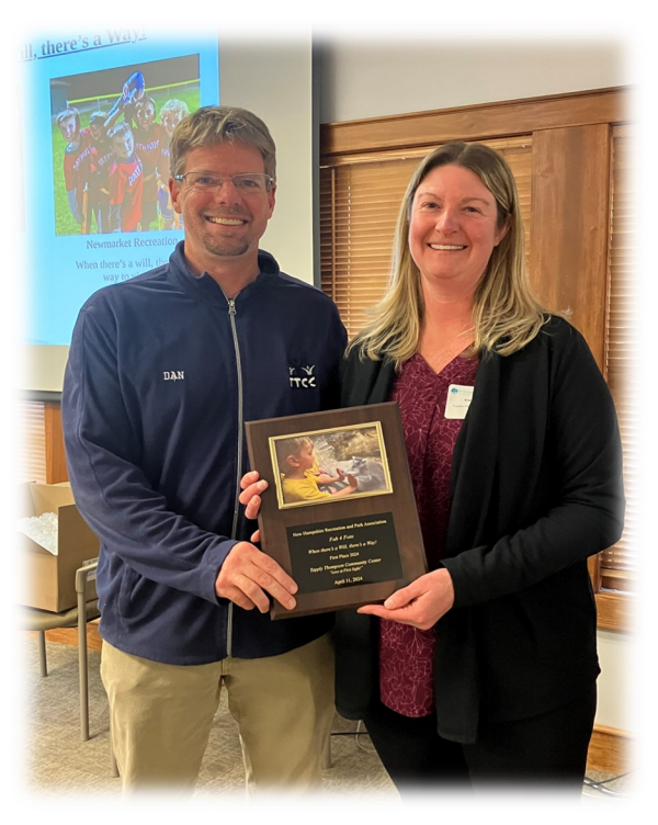
Tapply Thompson Community Center Fab 4 FOTO Award