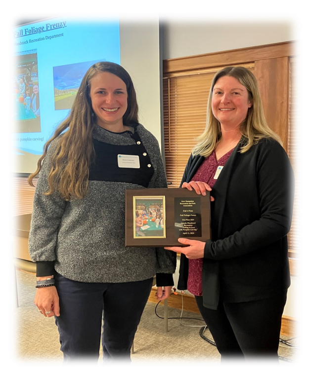
Lincoln Woodstock Recreation Fab 4 FOTO Award