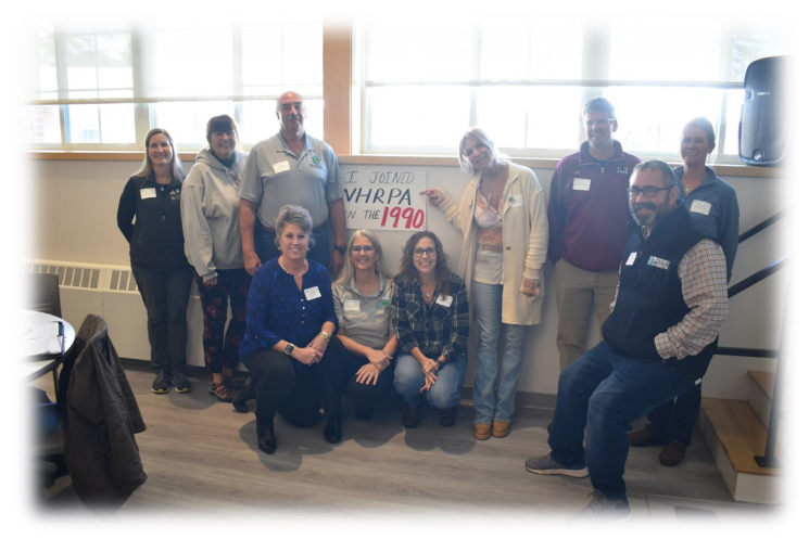
Memories from 2023 State Conference