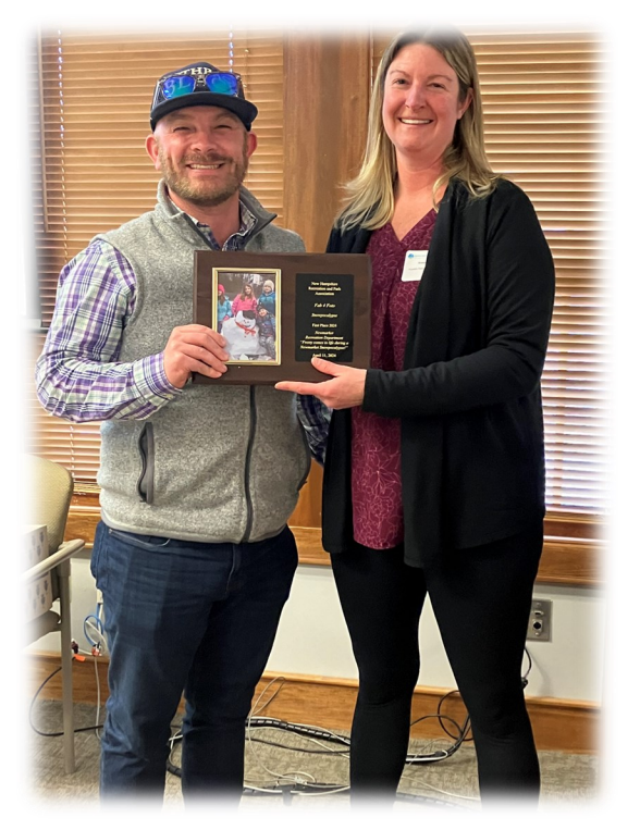
Newmarket Recreation Fab 4 FOTO Award